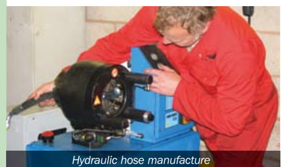
Hydraulic hose manufacture