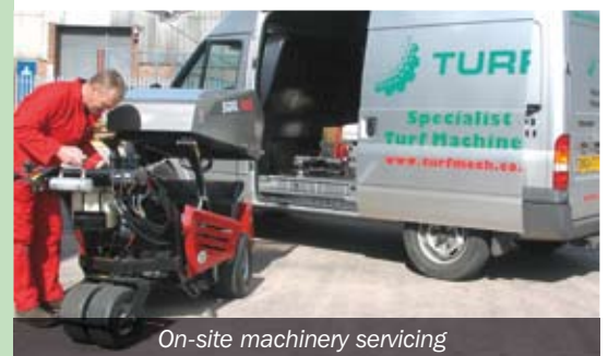
On-site machinery servicing