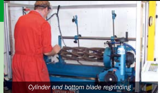
Cylinder and bottom blade regrinding